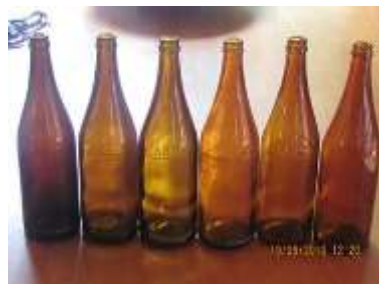
These old school original Tall neck ABC Beer Bottles all dated starting from left to right on bottom edge under writing is the date 1933, all the rest are dated on the bottom, 1939, 1940, 1944, 1954 & 1963